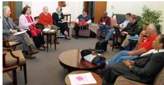
The Executive Committee of the Council of Indigenous Ministries of the Episcopal Church met at the cathedral in April.