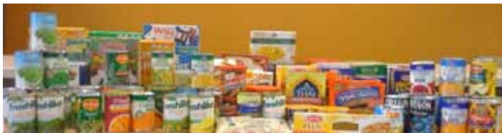
The $20 Hunger Walk registration fee buys 100 lbs. of food.