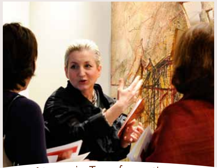
Scene at the cathedral: The opening reception of Icons in Transformation exhibit