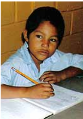
A student at El Hogar.