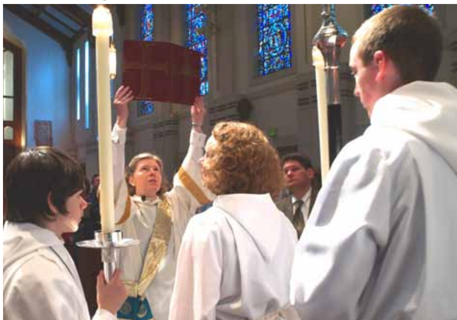
The Easter Vigil at Christ Church Cathedral on Saturday, April 23, was a glorious celebration.