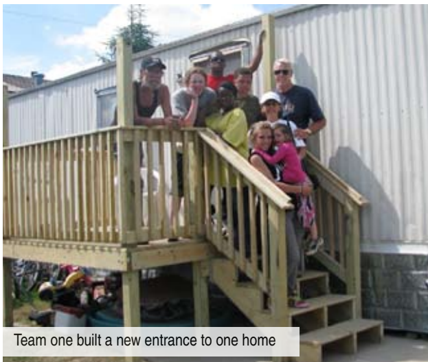
Team one built a new entrance to one home