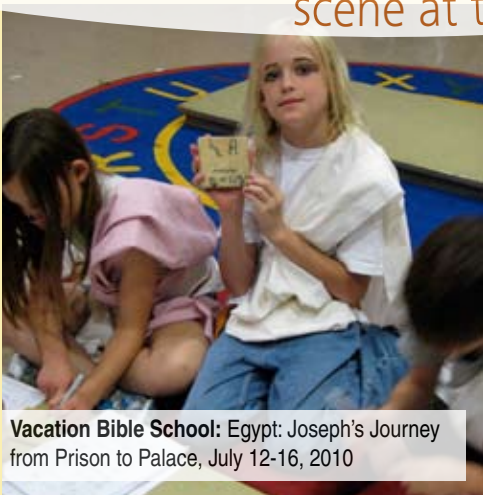
Vacation Bible School: Egypt: Joseph's Journey from Prison to Palace, July 12-16, 2010