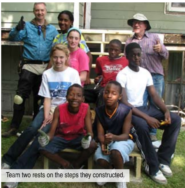
Team two rests on the steps they constructed.