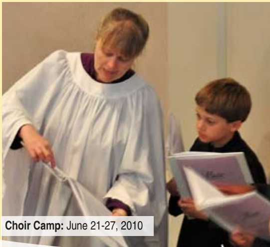
Choir Camp: June 21-27, 2010