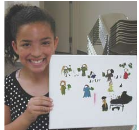
Last year's music camp

available from Judy Beiring at jmbeiring@cinci.rr.com .