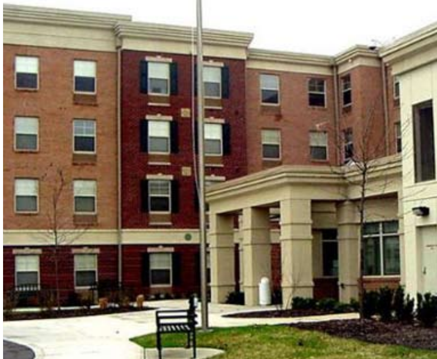
The National Church Residences' Commons on Grant project in Columbus, Ohio, is an example of a church-supported housing project.